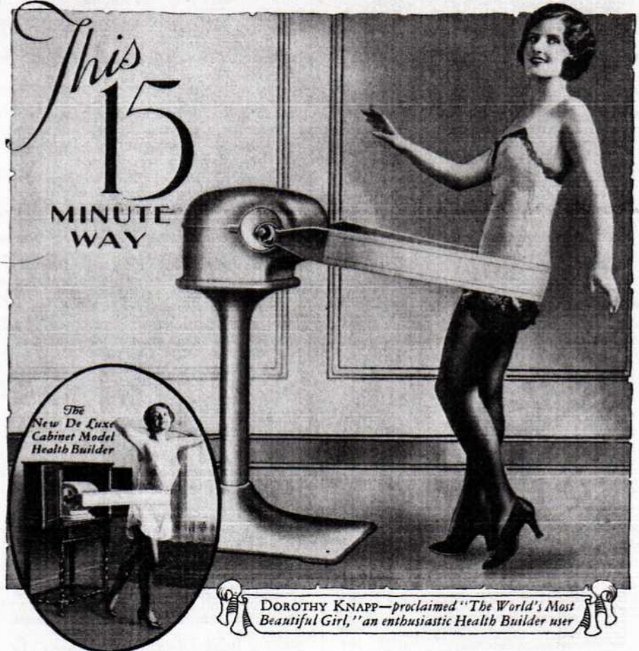
DOROTHY KNAPP—proclaimed "The World's Most Beautiful Girl," an enthusiastic Health Builder user

NOW , more than ever before, the modern woman is intolerant of overweight. Not only because of fashion's decree, but more important, for radiant health and vigor, a figure of youthful slenderness is much to be desired.