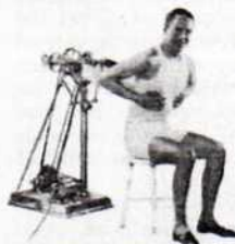
Illustrating the World Famous Athletic Model Health Builder

Only 15 minutes a day of delightfully soothing vibratory exercise and massage—the unique method devised in Battle Creek, world's health